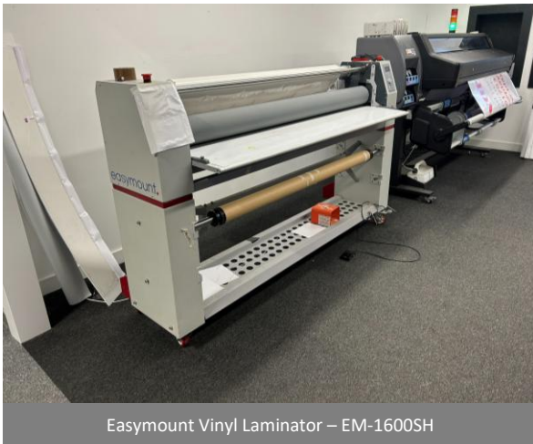
Easymount Vinyl Laminator – EM-1600SH