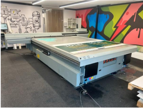
OCE Varia Dot Arizona 480XT Wide Format, Flat Bed Plotter (2013)