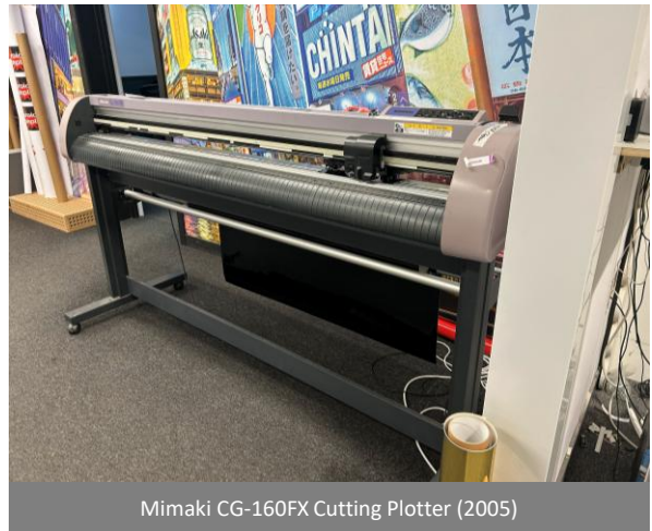
Mimaki CG-160FX Cutting Plotter (2005)