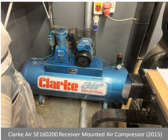
Clarke Air SE160200 Receiver Mounted Air Compressor (2015)