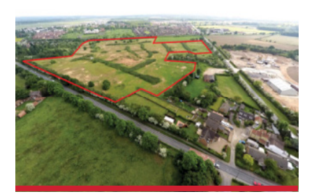
LAND NEAR DONCASTER SOUTH YORKSHIRE