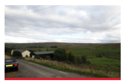
BLACKLOT & THORNEY KHOWE, LAND LLENDALE