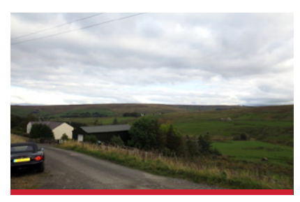
BLACKLOT & THORNEY KHOWE, LAND LLENDALE